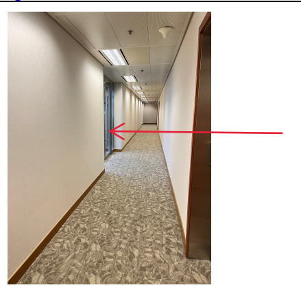
and you will find our reception desk for registration.