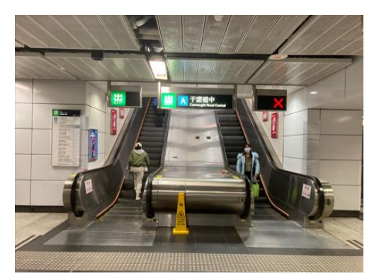
5. Exit A. Take the escalator to the ground.