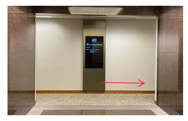
19. Upon arriving the 40/F, find the signage board which 20. Turn left to the entrance of Room 4005. Walk inside indicate "4005-08" and turn right.