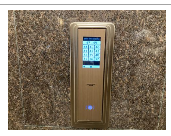
18. Key in "40" and follow the instruction on the panel to the designated elevator.