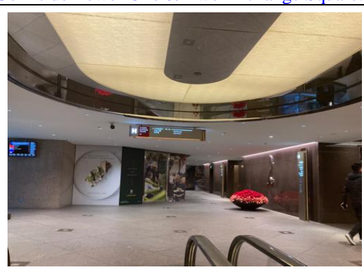
12. Take the escalator to the lift lobby. Then turn right.