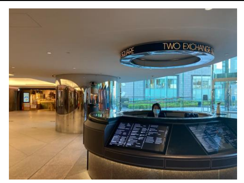
16. You will see the info counter for Two Exchange Square and a café, then turn left.