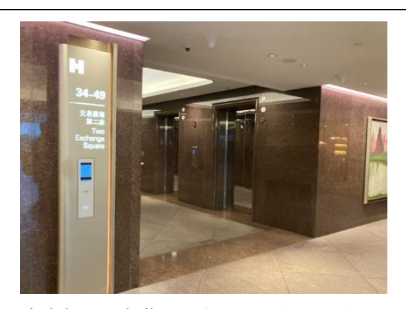
17. Find the "H" hallway of Two Exchange Square, and take the elevator.