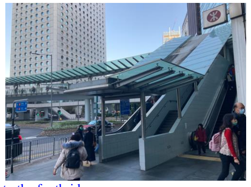
8. Go to the footbridge.