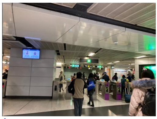
3. To the gate.