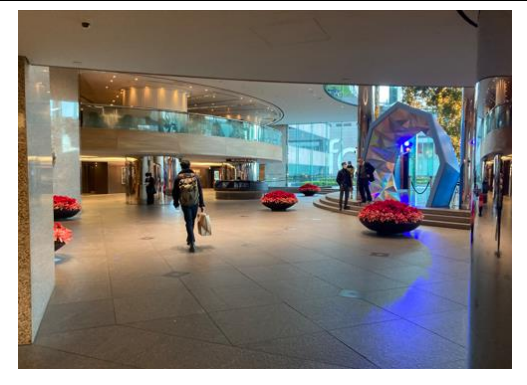
15. Go straight.