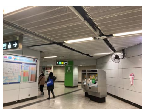
4. Turn right to Exit A. Exit A is next to Heng Seng Bank ATM.