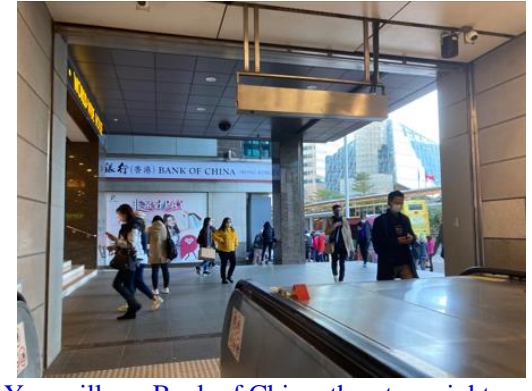
6. You will see Bank of China, then turn right.