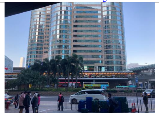
7. You will see the Exchange Square Tower, then turn right.