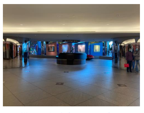
14. You will see the info counter for One Exchange Square, then keep on walking to the left.