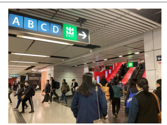
1.Platform. Take the escalator to the concourse.